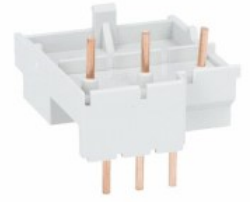
Rigid SM1 breaker-contactor connections SM1X Rigid SM1R breaker - BG contactor connections. SM1R...