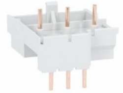
Rigid SM1 breaker-connector connections SM1X Rigid SM1P breaker - BG connector connections. SM1P...