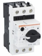
Motor protection circuit breaker SM1R