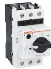
Motor protection circuit breaker SM1R