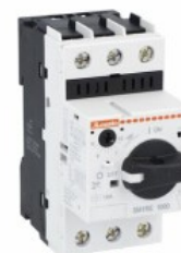
Motor protection circuit breaker SM1R