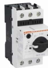
Motor protection circuit breaker SM1R