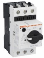
Motor protection circuit breaker SM1R