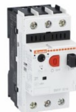
Motor protection circuit breaker SM1P