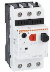
Motor protection circuit breaker SM1P