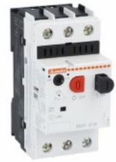
Motor protection circuit breaker SM1P