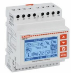
Interface protection system units compliant with Italian standard CEI 0-21 PMVF52