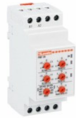
Frequency monitoring relays PMF20