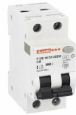
Residual current circuit breakers (RCCB) with overcurrent protection P1RE 1P+N 2 IEC