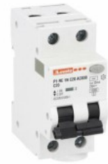
Residual current circuit breakers (RCCB) with overcurrent protection P1RE 1P+N 2 IEC