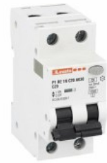
Residual current circuit breakers (RCCB) with overcurrent protection P1RE 1P+N 2 IEC