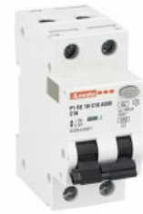
Residual current circuit breakers (RCCB) with overcurrent protection P1RE 1P+N 2 IEC