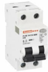
Residual current circuit breakers (RCCB) with overcurrent protection P1RE 1P+N 2 IEC