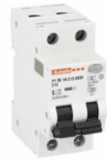
Residual current circuit breakers (RCCB) with overcurrent protection P1RE 1P+N 2 IEC