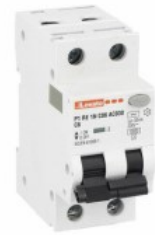
Residual current circuit breakers (RCCB) with overcurrent protection P1RE 1P+N 2 IEC