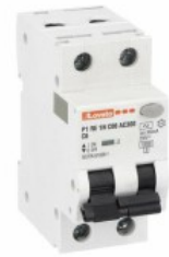
Residual current circuit breakers (RCCB) with overcurrent protection P1RE 1P+N 2 IEC