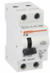
Residual current circuit breaker with overcurrent protection (RCBO) P1 RB 1P+N 2 IEC