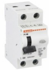
Residual current circuit breaker with overcurrent protection (RCBO) P1 RB 1P+N 2 IEC