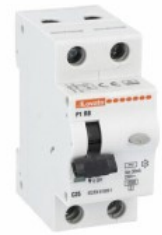
Residual current circuit breaker with overcurrent protection (RCBO) P1 RB 1P+N 2 IEC