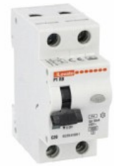
Residual current circuit breaker with overcurrent protection (RCBO) P1 RB 1P+N 2 IEC