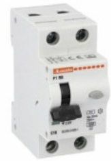
Residual current circuit breaker with overcurrent protection (RCBO) P1 RB 1P+N 2 IEC