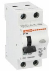
Residual current circuit breaker with overcurrent protection (RCBO) P1 RB 1P+N 2 IEC