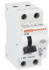
Residual current circuit breaker with overcurrent protection (RCBO) P1 RB 1P+N 2 IEC