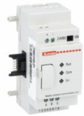
Micro PLC expansion module, RS485 Modbus RTU communication port LREP00 24VDC