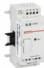
Micro PLC expansion module, 4 digital inputs + 4 transistor outputs LRE08TD024