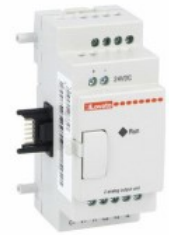
Micro PLC expansion module, 2 analog outputs 0...10VDC/0...20mA LRE02AD024 24VDC Nr. 2 analog