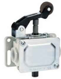
Roller centre push lever PLN...H