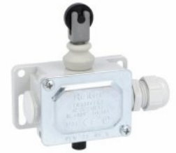
Top roller push plunger PLN...R