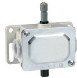
Top push rod plunger PLN...A