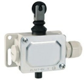
Top roller push plunger PLN...R