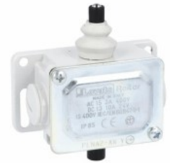
Top push rod plunger PLN...A