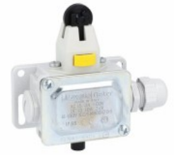
Latch and manual release - Top roller push plunger PLNA1RAGW