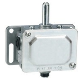
Manual reload and magnetic release - Top push rod plunger PLA1AMW