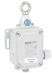
Rope-pull lever with reset button P2L151312