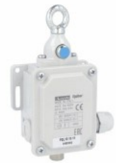
Rope-pull lever with reset button P2L131312