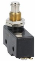
Top push rod - metal plunger. M12 fixing head KSA4