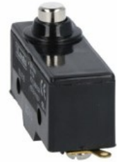
Top push rod - metal and low rod plunger KSA3