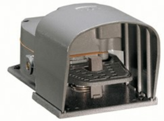
One pedal, with safety lever - with cover KR210