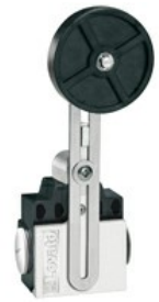
Adjustable roller lever KNF