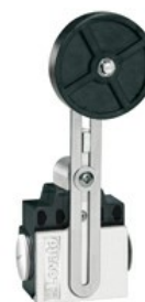
Adjustable roller lever KNF