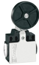
Roller lever plunger KNE