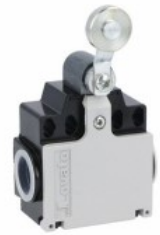
Roller lever plunger KNE