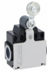
Roller lever plunger KNE