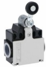
Roller lever plunger KNE