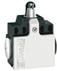
Top roller push plunger KNB