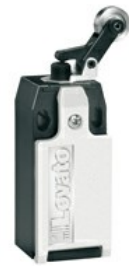
Roller side push lever KMD